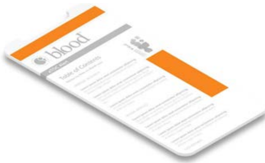
Table of Contents (TOC) Email Banner Ads