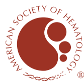
TABLE OF CONTENTS ►